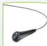
Patient response switch