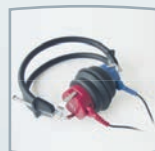
AC headset TDH39