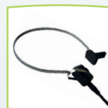
BC headset B71