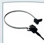
BC headset B81