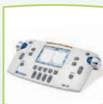
MA 42 device