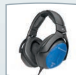
AC headset HDA300