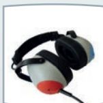
AC headset Holmco 8103