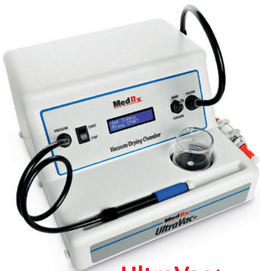
UltraVac+ Vacuum & Drying Chamber