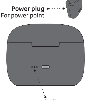
Battery indicator Displays charging status of the power bank/power bank battery levels