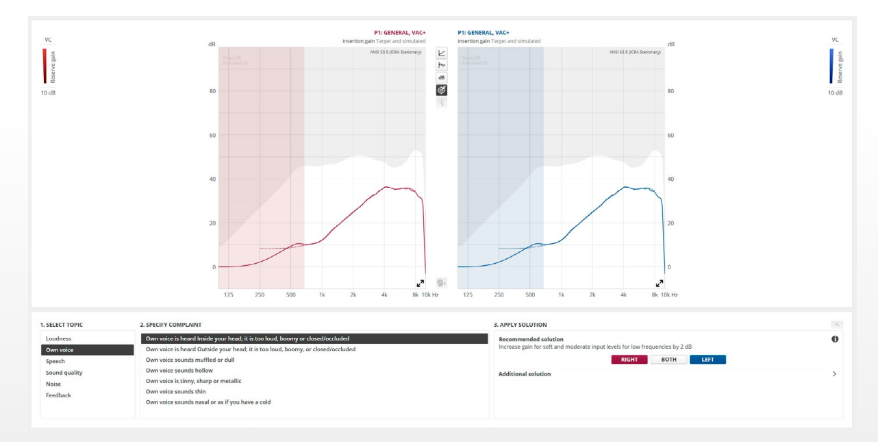
Figure 1. An example of a fitting in Oticon Fitting Assistant.

When Speech Rescue™ is activated, Fitting Assistant operates in the following way: If High frequency bands are set to OFF in the Speech Rescue panel, Fitting Assistant will override this by allowing high frequency gain changes, unlike for manual fine-tuning. The hearing care professional will be alerted via a text warning.