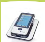
easyScreen device with cradle

Specifications are subject to change without notice.