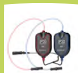
Insert earphones IP30