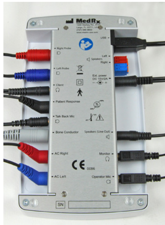
Underside of Unit