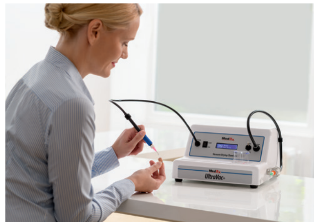
The Vacuum & Pressure Wands work simultaneously.

1800 639 263 info@soniceq.com soniceq.com